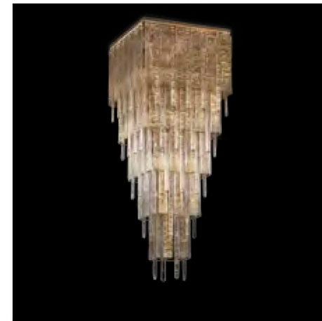
PL7502Q-50x125-KK1 W 50 cm - H 125 cm - D 50 cm E14 x 12 MAX 40W 50 KG