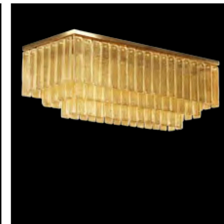
PL7500R-40x100x35-KK1 W 100 cm - H 35 cm - D 40 cm E14 x 9 MAX 40W 40 KG