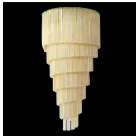
PL7503-70x140-AK3 Ø 70 cm - H 140 cm E14 x 20 MAX 40W 80 KG