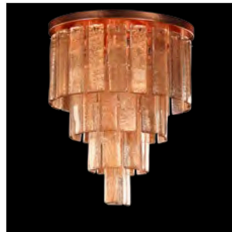
PL7501-40x50-U1 Ø 40 cm - H 50 cm E14 x 5 MAX 40W 15 KG