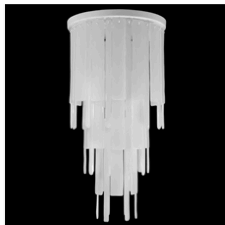
PL7502R-40x80-S Ø 40 cm - H 80 cm E14 x 6 MAX 40W 20 KG