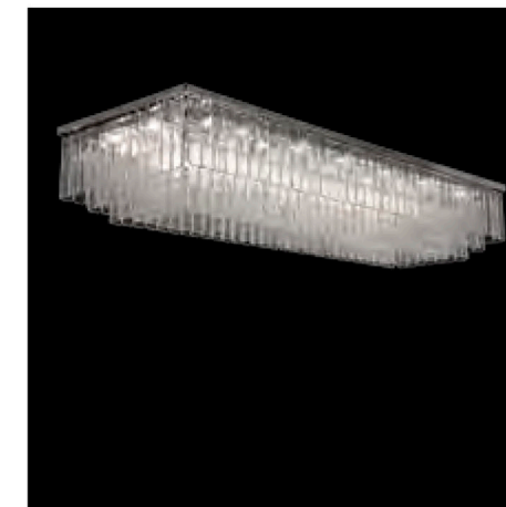
PL7500R-68x200x30-C W 68 cm - H 30 cm - D 200 cm E14 x 30 MAX 40W 87 KG