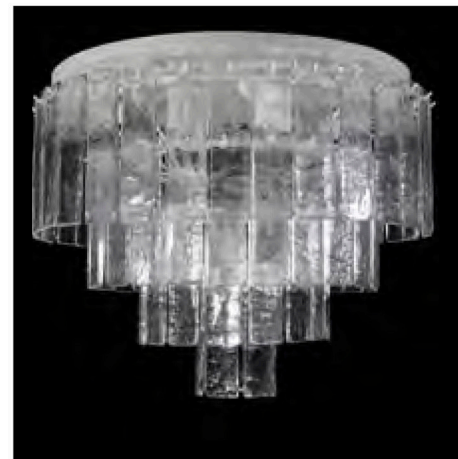
PL7501-60x55-C Ø 60 cm - H 55 cm E14 x 9 MAX 40W 22 KG