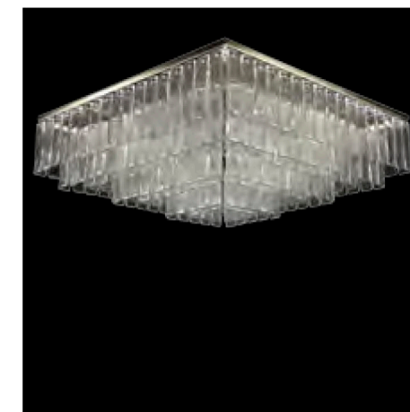
PL7500Q-100x40-C W 100 cm - H 40 cm - D 100 cm E14 x 20 MAX 40W 85 KG