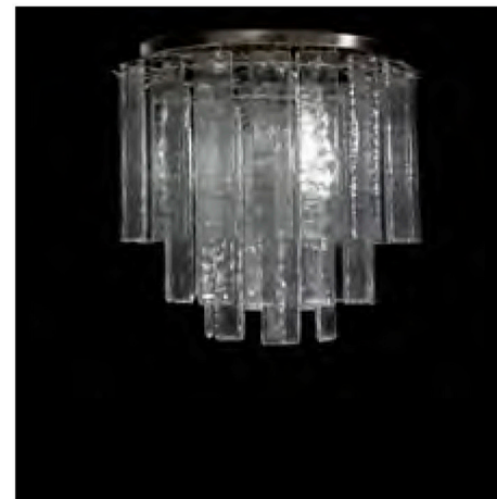
PL7501-30x30-C Ø 30 cm - H 30 cm E14 x 4 MAX 40W 12 KG