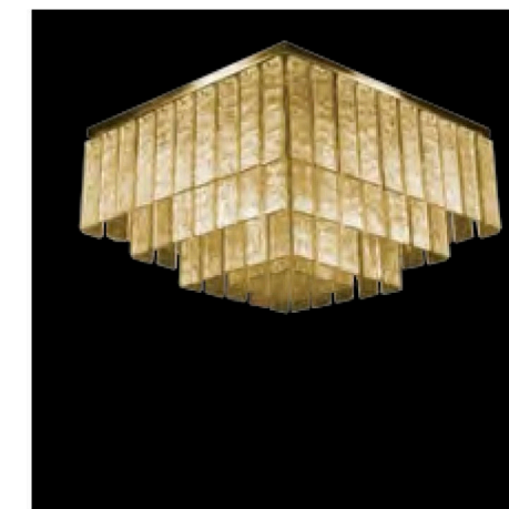
PL7500Q-60x40-K W 60 cm - H 40 cm - D 60 cm E14 x 9 MAX 40W 30 KG