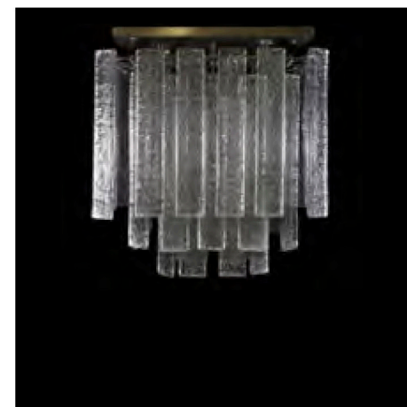
PL7500Q-50x40-E W 50 cm - H 40 cm - D 50 cm E14 x 4 MAX 40W 20 KG