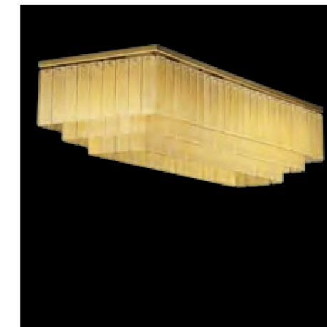
PL7500R-50x140x35-AK3 W 140 cm - H 35 cm - D 50 cm E14 x 10 MAX 40W 60 KG