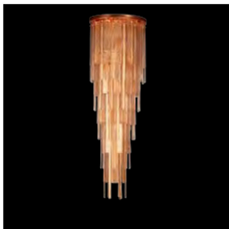
PL7502-40x125-U1 Ø 40 cm - H 125 cm E14 x 11 MAX 40W 30 KG